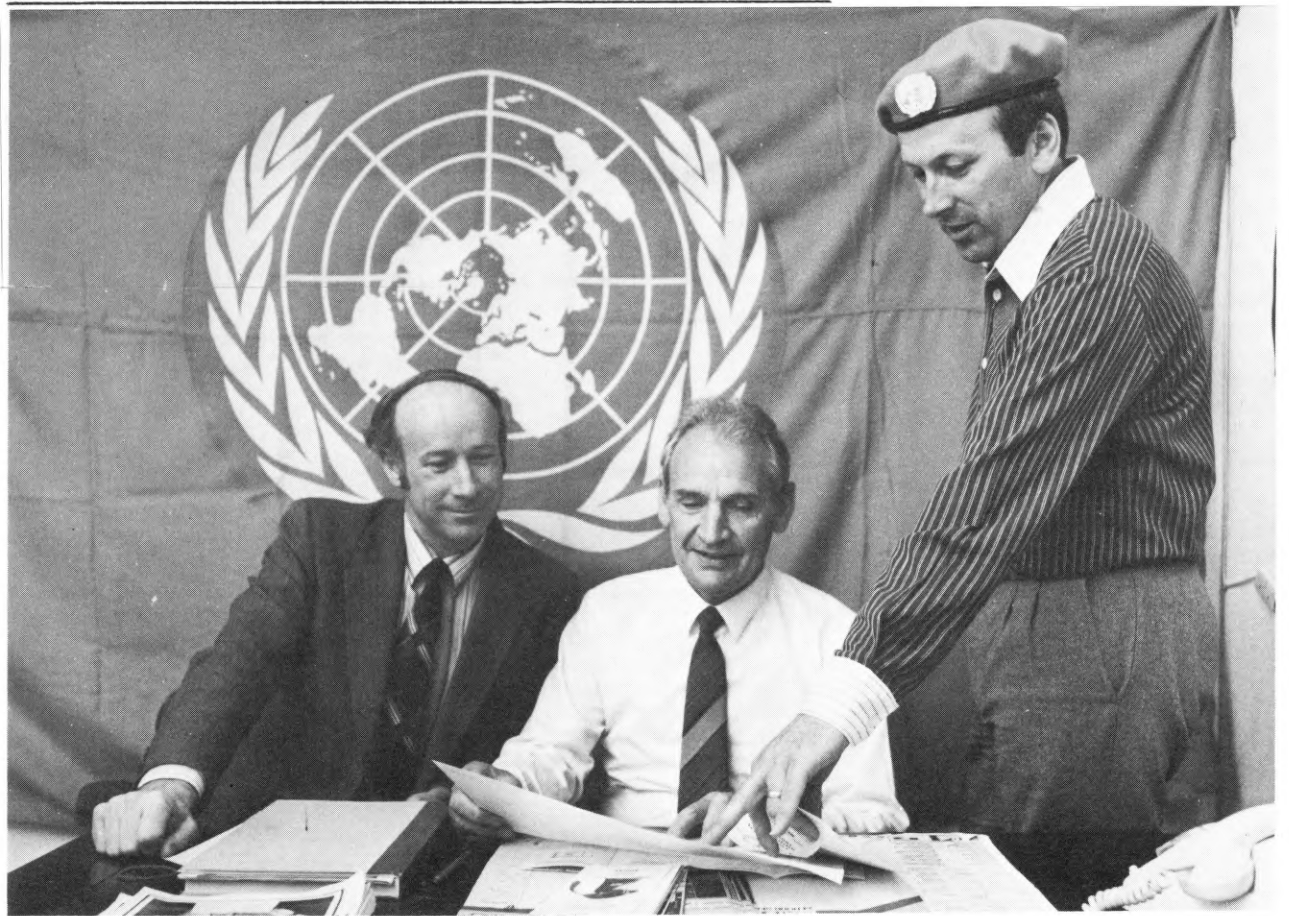
UNITED NATIONS FORCE IN CYPRUS