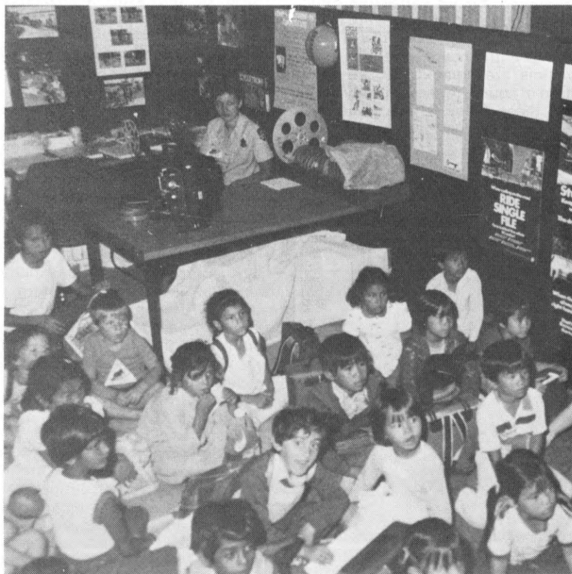
• Interested young show-goers find Police education films very much to their liking.