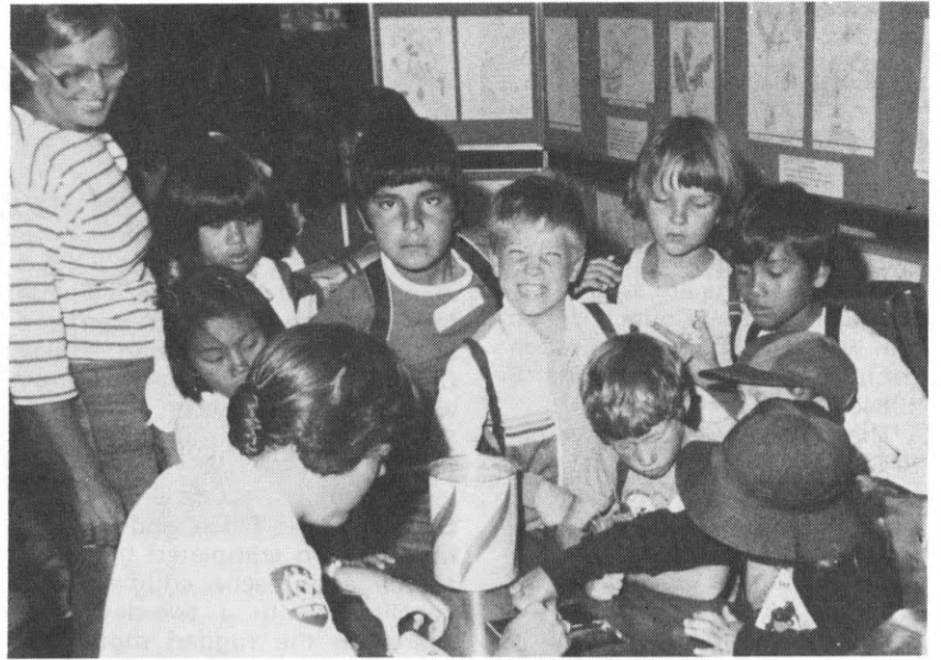
• Children attending Royal Canberra Show crammed the AFP display to see how their fingerprints looked.

The stands were manned in shifts throughout the three days from 8 am until 11pm.