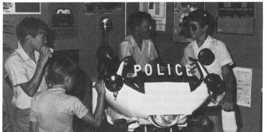
• A particularly popular exhibit was this police patrol motorcycle. Below, road safety explained for younger cyclists.