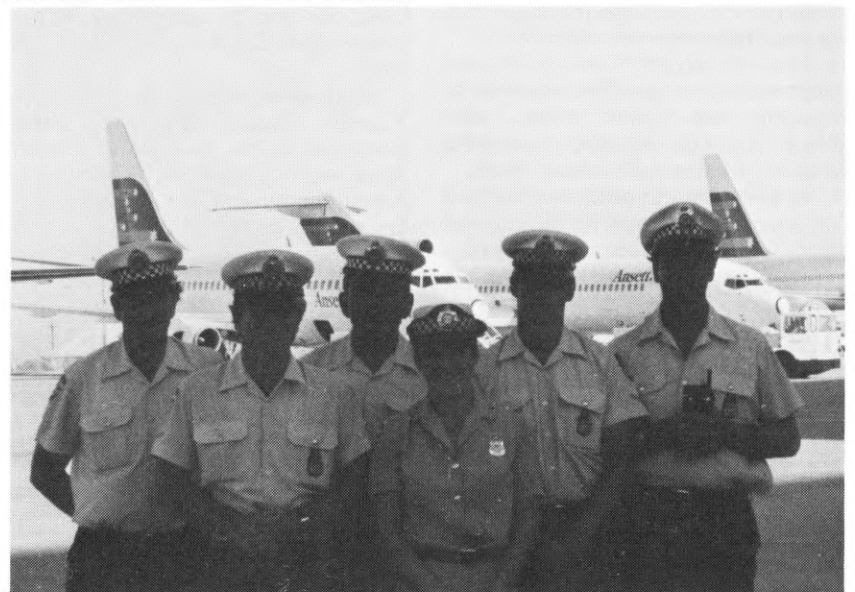
• AFP members on duty at Melbourne Airport for the open weekend.