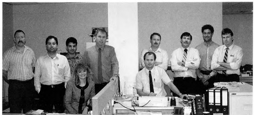
Some members and staff of the Gold Coast Branch

"For the Federal Police, the State Police and the CJC to have mounted such a long and detailed campaign is remarkable. The organisation behind it must have been excellent. All involved in the investigation and presentation of this matter should be commended by the Court and I do so now."