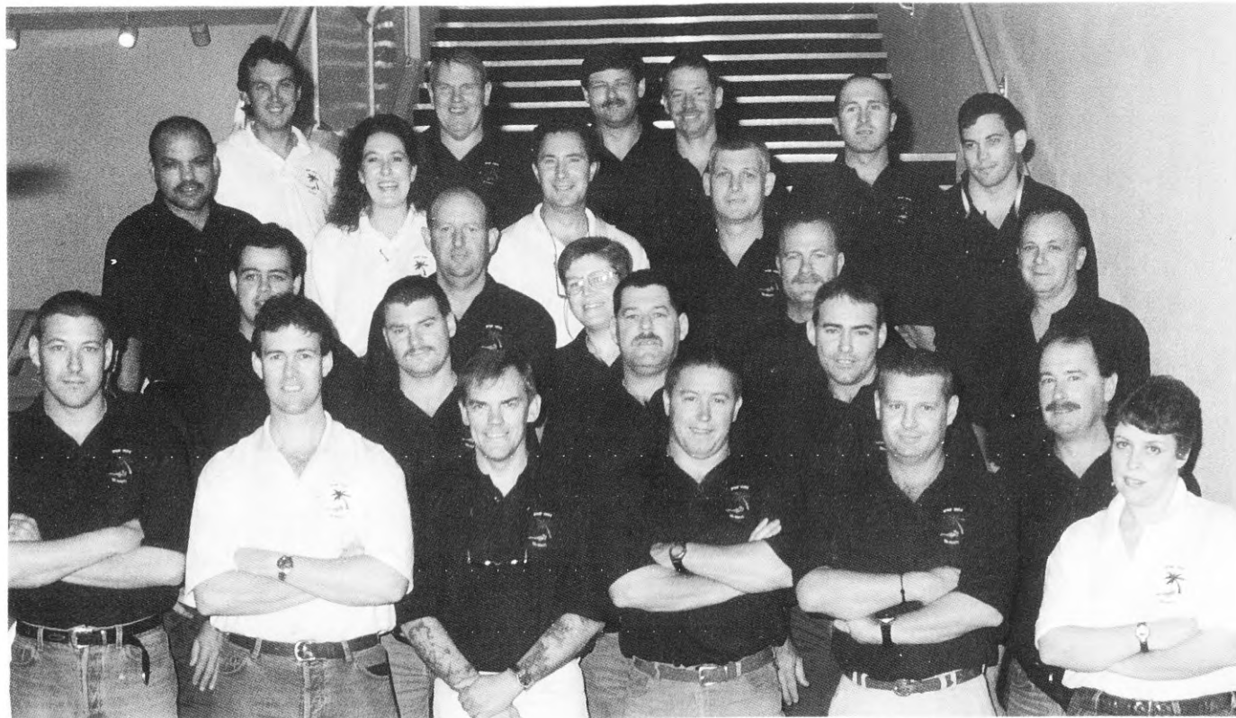
Members of the Haiti Contingent departing Canberra Airport.

F OLLOWING an announcement on September 21 by the Minister for Foreign Affairs Senator Gareth Evans and the Minister for Justice Mr Duncan Kerr that Australia would lend its support to the restoration of democracy in Haiti, the AFP started the process of providing 30 police volunteers to help monitor the