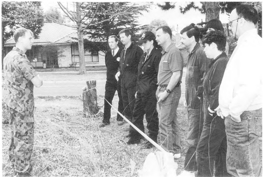
An Army explosives expert instructing Haiti Contingent members on marking off suspected mine locations.