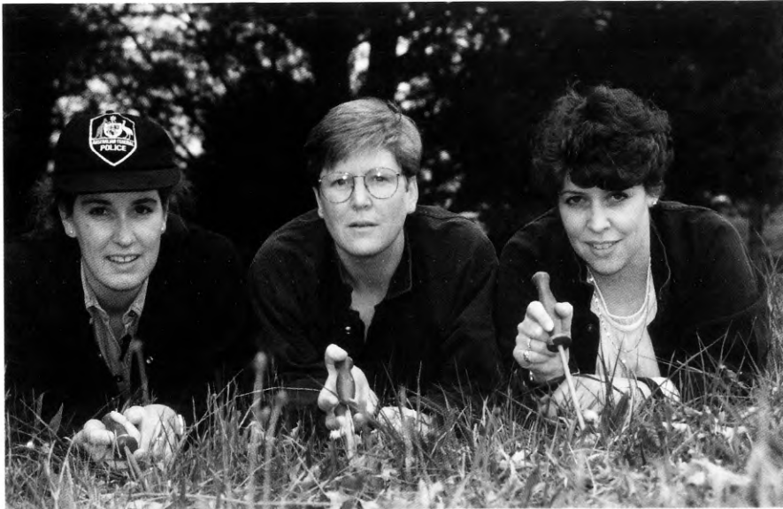
The 30-member Haiti peacekeeping contingent included three women from the AFP.

convicted of falsely completing medical forms for his de facto wife to claim benefits while she was working as his secretary-receptionist.