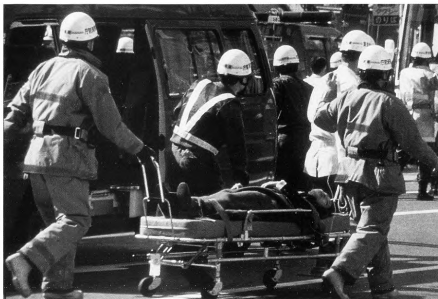
In March a new era of terrorism was experienced in Tokyo's subways when 12 people died and 5,500 were injured from exposure to nerve gas planted on peak hour trains. AFP officers immediately commenced investigating an Australian connection.