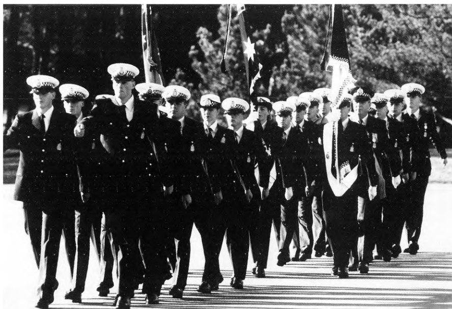
In July, five women and 15 men marked their graduation with a parade at the Weston police complex.