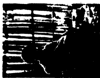
Cover: A young girl at a resettlement camp in Gojam Province, Ethiopia. Australia continues to assist with the famine relief in Africa. See news release issued by the Minister for Foreign Affairs on 22 December appearing on page 1210 of this issue of AFAR.

ISSN 0311-7995 VOLUME 56 • NUMBER 12 • DECEMBER 1985