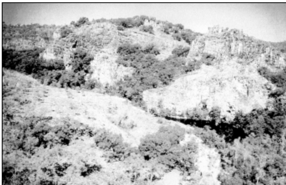
Figure 4: Arnhem Land escarpment cyclone and flood refuges (Russell-Smith)

Tindale (1940) observed wet season stringy bark huts to shelter 30 or more persons which, if more than one such hut were erected, would have implied a considerably larger aggregation than forty or fifty. Rose also observed a group of two or three of such wet season huts on 28 November 1938, but their size was considerably smaller than Tindale reported (10 x 30 feet) and altogether would not have housed more than twenty to thirty Aborigines. Tindale reproduced a photograph showing ten adult men. This would have implied a foraging group numbering between forty and sixty men, women and