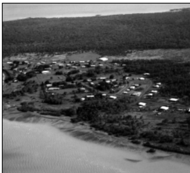
Figure 1: Warruwi Community, South Goulburn Island, Northern Territory