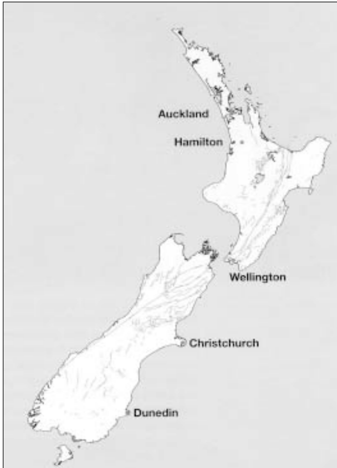
Figure 1: A selection of New Zealand's historic high magnitude earthquakes (GNS).

Throughout the 1980s and early 1990s an extensive series of reforms took place in New Zealand. It was decided to devolve decision making from central government to the regional and local authorities where problems occurred. Re-organisation occurred at central government level (for example, this included a new Ministry for the Environment, Parliamentary Commissioner for the Environment and Department of Conservation) and at regional and local level with the amalgamation of existing councils and the establishment