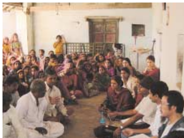
Figure 6: Community Workshop

The role of the Project Team was to facilitate the reconstruction process. The composition of the team was therefore very important. Getting appropriate staff members with suitable motivation and skills was difficult, however suitable training and encouragement helped. Establishing good relationships with the community was the foremost responsibility of the Project Team, skills and knowledge followed. The