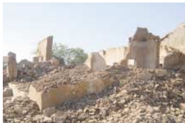
Figure 3: Damage to rural housing in Patanka