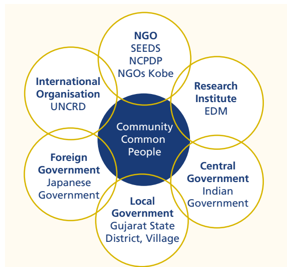
Figure 1: Involvement of different stakeholders

An unparalleled earthquake (magnitude 7.7, USGS) devastated the Gujarat State in Western India on 26 January 2001 bringing with it unprecedented and widespread loss of lives and property. More than 13,000 people lost their lives and thousands were injured (GSDMA, 2002) in the quake affecting an area stretching more than 400 km, including urban, semi-urban and rural areas. Several villages close to the epicentre were completely destroyed. Over 300,000 buildings collapsed and more than twice that number were severely damaged. The earthquake was a tragic blow to the region already suffering from drought conditions and the aftermath of a cyclone three years