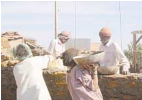
Figure 7: Family builds its own house

Local requirements needed to be matched with available options. Failing to find the best requirement/option fit may have caused several problems, as evidenced in the rehabilitation process after the Kobe earthquake of 1995