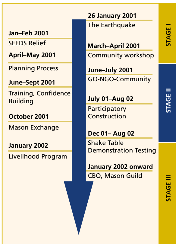
Figure 4: Chronology of events in PNY project

The first task was setting up the basic principles for planning the rehabilitation intervention. The intervention had to be participatory increasing community involvement gradually. The program had to be flexible with enough buffers for time and resources created in the overall project schedule. The intervention had to follow the minimum standards on the quality of benefits for the community. Rehabilitation was not just a short term, gap-filling exercise. In most cases, the community faced the threat of recurrent disasters and therefore the rehabilitation was aimed at reducing their vulnerability. This implied building the community's assets, achieving sustainability of residents' livelihoods, building houses that could protect residents against