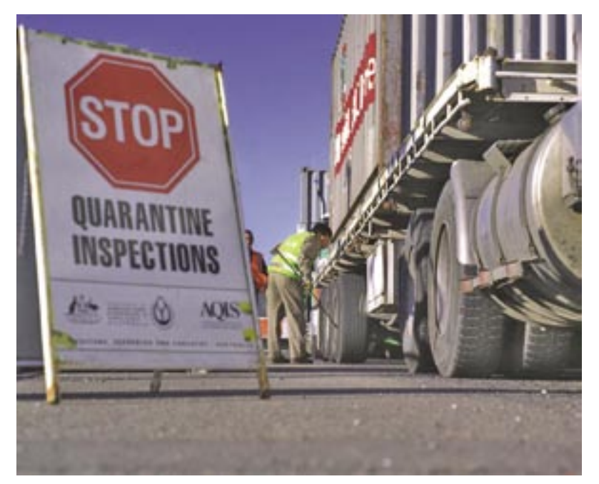
AQIS staff inspect the outside of containers for pests and diseases