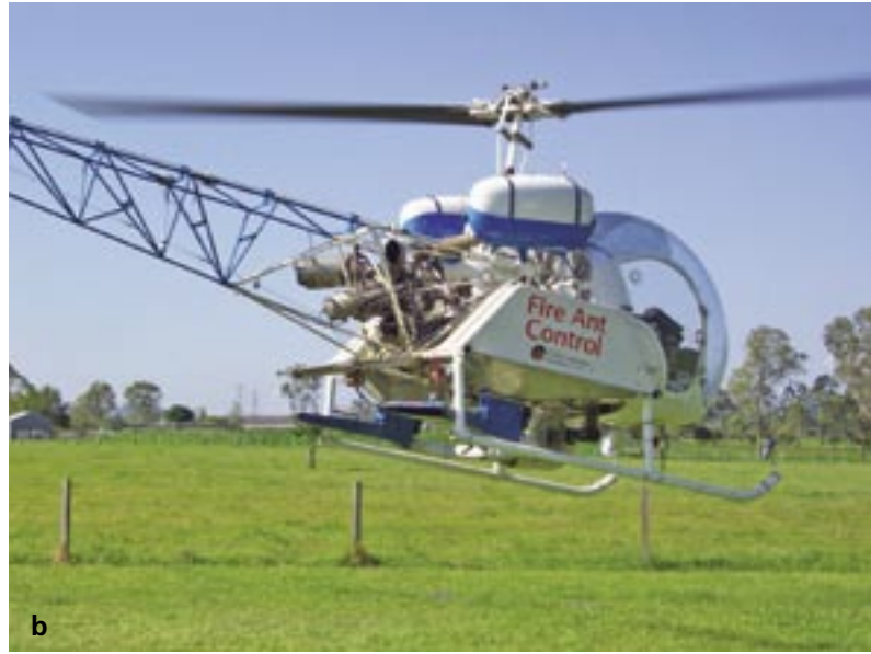
Figure 4. Treatment methods used by the Fire Ant Control Centre include a) ATV quad bikes, b) Helicopters, and c) rotary hand held spreaders

additional 10,000 ha surveyed beyond these buffers during targeted surveillance. There has also been extensive active and passive surveillance across Australia and with no infestations detected; it appears RIFA are confined to southeast Queensland.