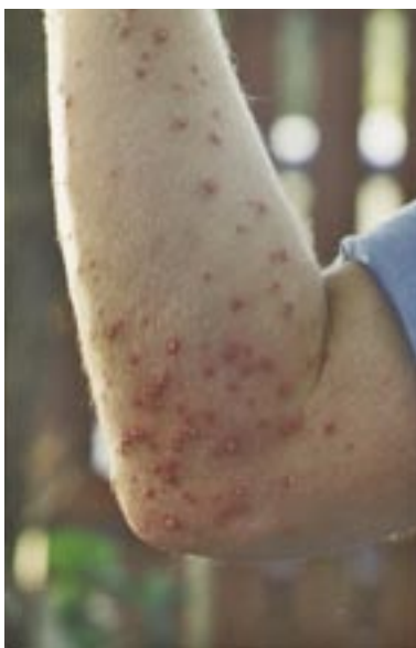
Figure 3. This photo was taken 24 hours after the person was stung and shows the characteristic pustules from multiple Red Imported Fire Ant stings

RIFA is a native of South America introduced to the United States in the late 1930's where, in the absence of natural parasites and predators, it has become a major environmental and economic pest in the southern states. The ant has spread to at least nine southern US States with estimates of a total spread of 275 million acres. For urban areas alone in Texas, the cost from RIFA is estimated at more than $US 581 million a year. In over nine heavily infested states in the USA losses are estimated at $US2.77 billion annually.