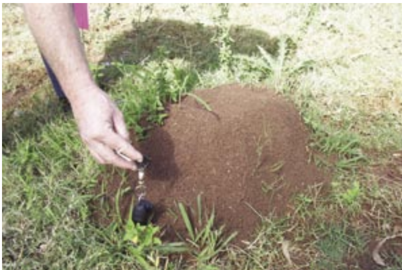
Figure 2. A typical dome shaped nest. Note the lack of entry hole on the dome and the lack of vegetation