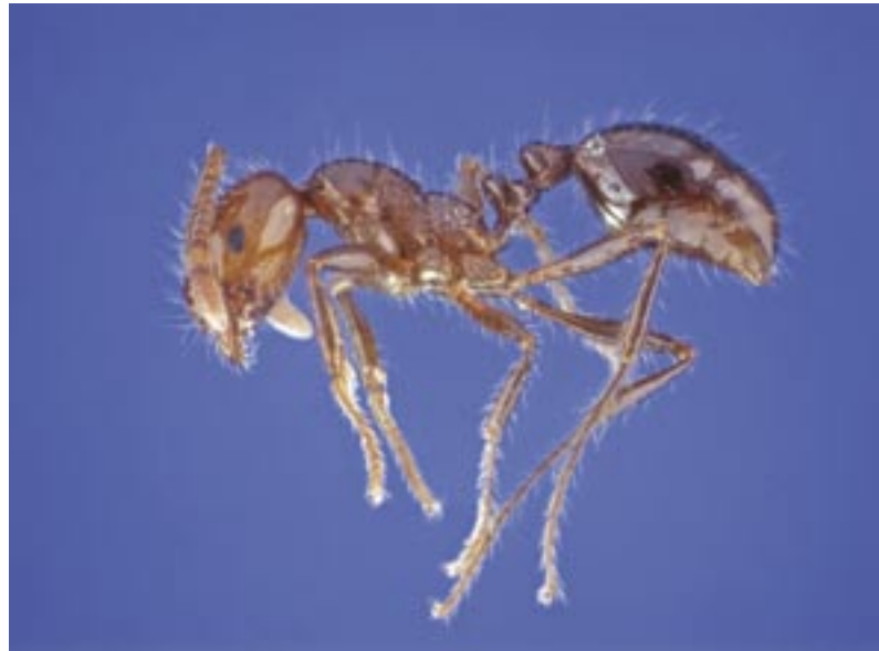
Figure 1. A worker Red Imported Fire Ant, Solenopsis invicta

The FACC is an amazing organisational accomplishment. Between the date when the ant was discovered in February