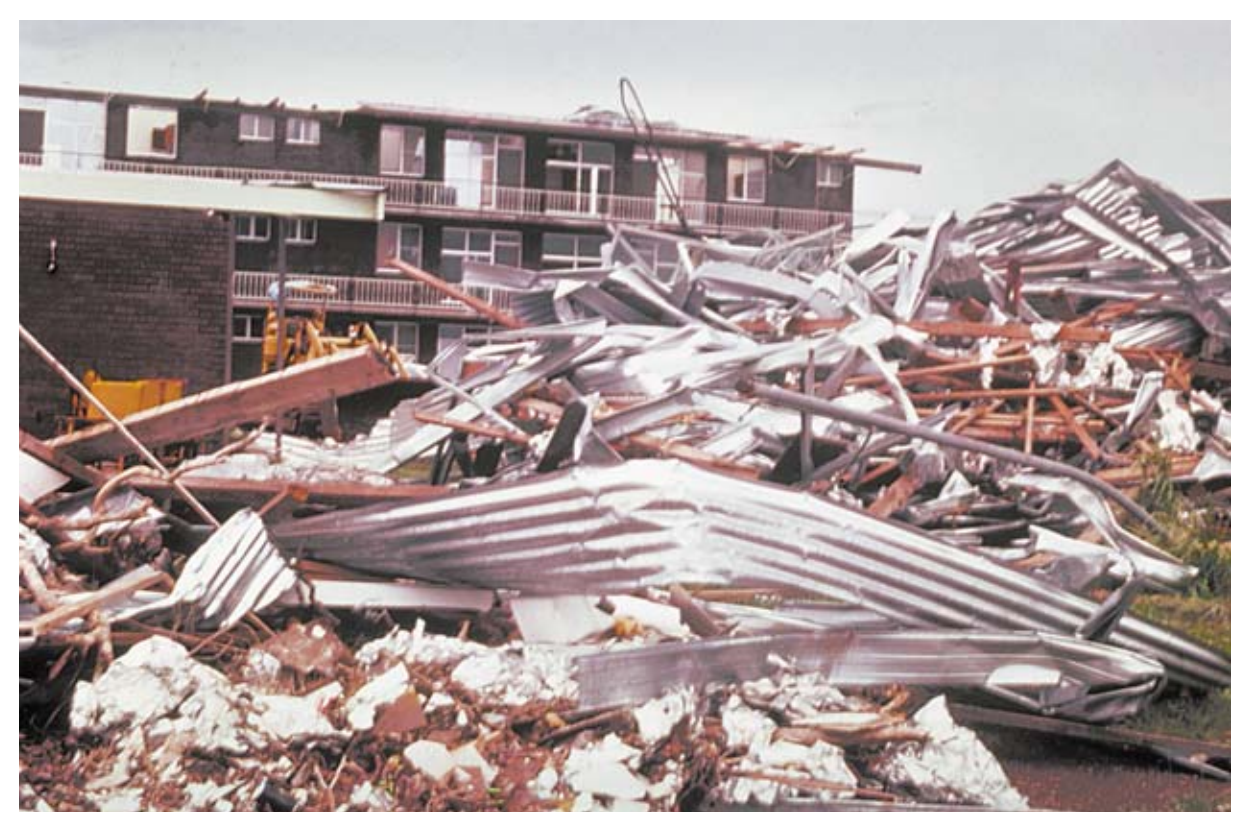
Critical infrastructure protection has grown to include vital assets including building structures and lifeline utilities