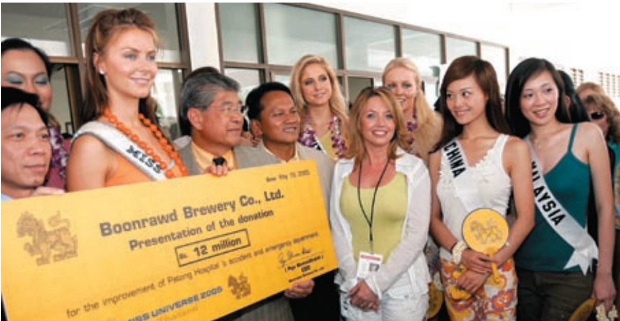
The Miss Universe contest in Phuket in May 2005.

building and construction industry has provided a source of employment to many previously employed in the tourism industry. So while building materials are predominately imported into the region from mainland Thailand, the labour used in reconstruction has been provided from local informal workers who previously worked in the tourism business. Although they are paid less than they earned in their previous occupations, it is still a significant proportion of household income. The construction of large up-market resorts—which in themselves will have long term ramifications for the informal sector—is providing work that local people hope will last until the tourism industry recovers and they can return to their usual occupations.