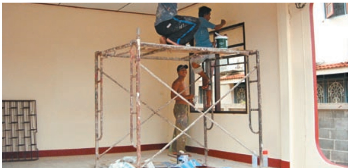
Informal sector workers shift to construction to secure a short-term income.