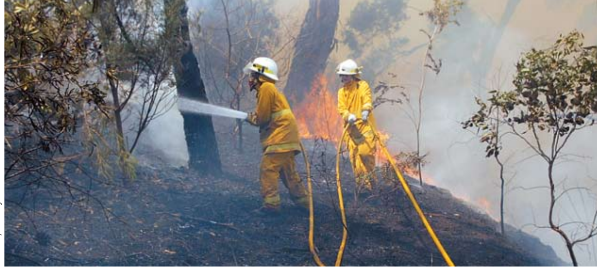
The main users of bush fire risk management plans in New South Wales are the Rural Fire Service.

Obscure content again serves as an inhibitor to the user in retaining important information. Other quite irrelevant content that is only poised to contribute to confusion and misunderstanding by the user includes references to numbers of cultural heritage assets in the region: