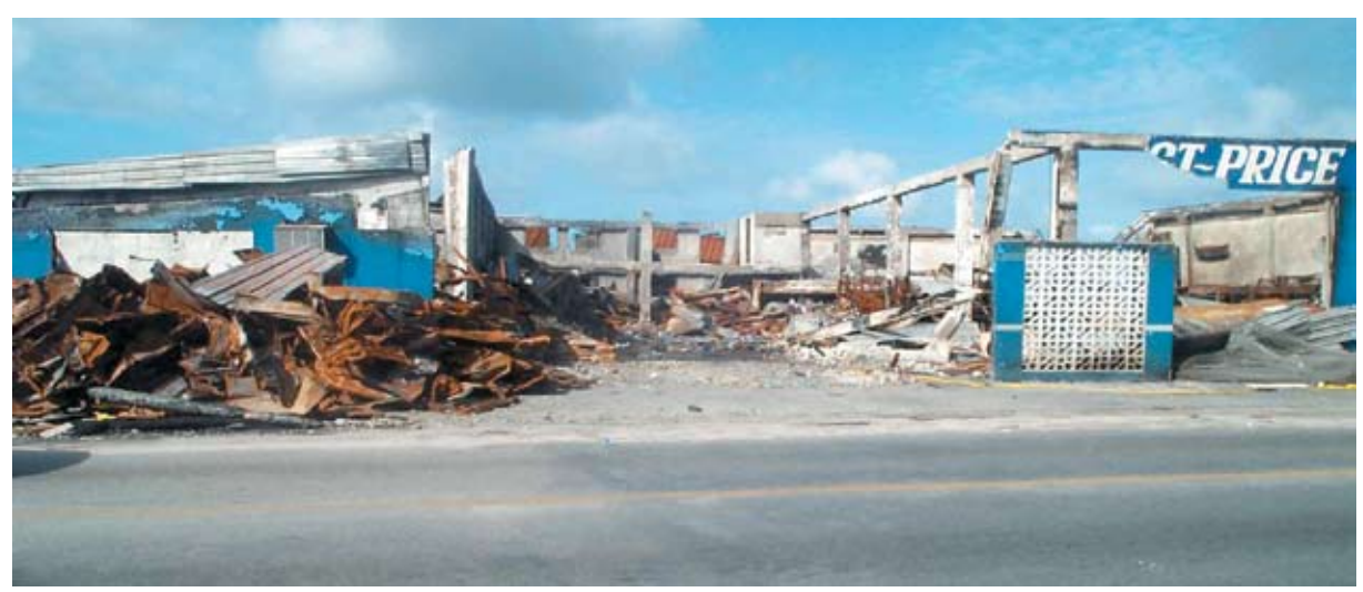
A major structure fire in the Marshall Islands in 2005 had a severe impact on the national economy.

In essence, good governance at the national government level must therefore include the embracing of, and commitment to, an integrated approach to disaster risk reduction and disaster management practices and more importantly placing a high priority on regarding adaptation to climate change and disaster risk management as a development issue.