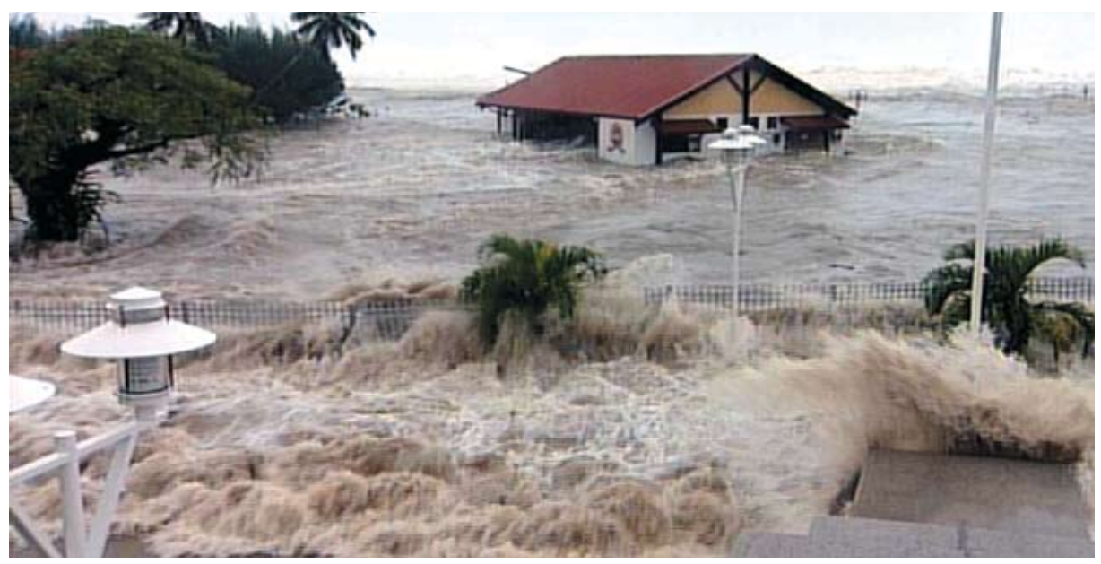
In early 2005 the Cook Islands were struck by 5 cyclones in a single month.

Mainstreaming disaster risk management: a development issue for the Pacific Small Island Developing States