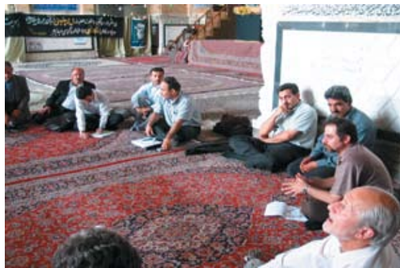
Fig 7: Community, designers and contractors in consultation inside the mosque of Bam.

and displayed their designs as life-size exhibition units and shared their technical knowledge of safe building with the people. Their building designs were approved and certified by the HF against a number of criteria, including that the design: