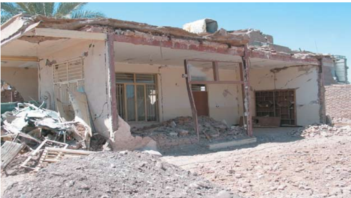
Fig 5: Damaged houses such as this one were classified on a grading system from 1-5.