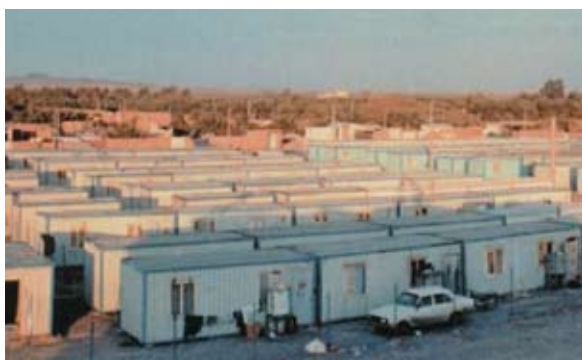
Fig 6: Temporary shelters on individually-owned plots of land (top) and pre-fabricated camp cities (bottom).

The priorities that they identified for the Bam reconstruction program are as follows: