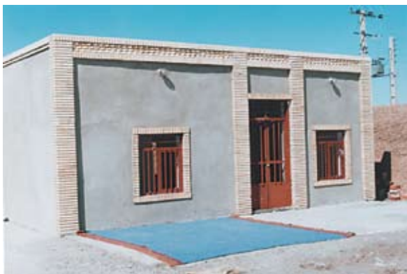
Fig 10: Reconstructed houses in Bam after less than two years.