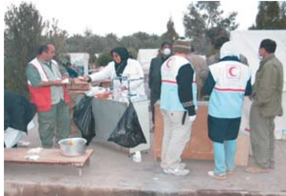
Fig 4: The IFRC and various NGOs set up field hospitals, distributed food items, tents and blankets in the emergency phase.

More than 1,600 search and rescue, health and relief personnel from 44 countries arrived in Iran to assist in the rescue and relief operations. Within hours of the earthquake, the UN dispatched its Disaster Assessment and Coordination Team (UNDAC) to support the Iranian Government in coordinating this enormous international response. The UN Country Team and UN agencies provided relief items as well as technical support. The International Federation of Red Cross and Red Crescent Societies (IFRC) and various Non-Governmental Organisations (NGOs) set up field hospitals and distributed food items and blankets (United Nations, 2004). Tents, as emergency shelters, were distributed among the homeless right from the early days (Fig 4).