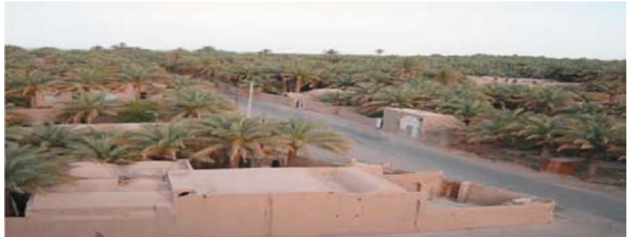
Fig 2: Residents believe that Bam is nothing without its date palms.