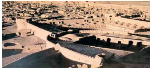
Fig 1: Bam before the Earthquake.

The Bam earthquake with a magnitude of 6.6 on the Richter Scale occurred at 5.28 am on 26th December 2003 and caused considerable human and financial loss in the region. More than 30,000 people were killed, 20,000 were injured and over 60,000 left homeless. Almost 80 per cent of Bam was ruined. It also caused considerable loss to lifeline infrastructures, such as the water supply network, power lines and also health care centres, educational buildings, cultural centres, and other cultural heritage (Fig 3). The epicentre was approximately 10 km to south-west of Bam. Damage was concentrated in a 16 km radius around the city, which is famed for its 2,500 year old citadel Arg-i-Bam . In terms of human cost, the Bam earthquake ranks as the worst recorded disaster in Iranian history.