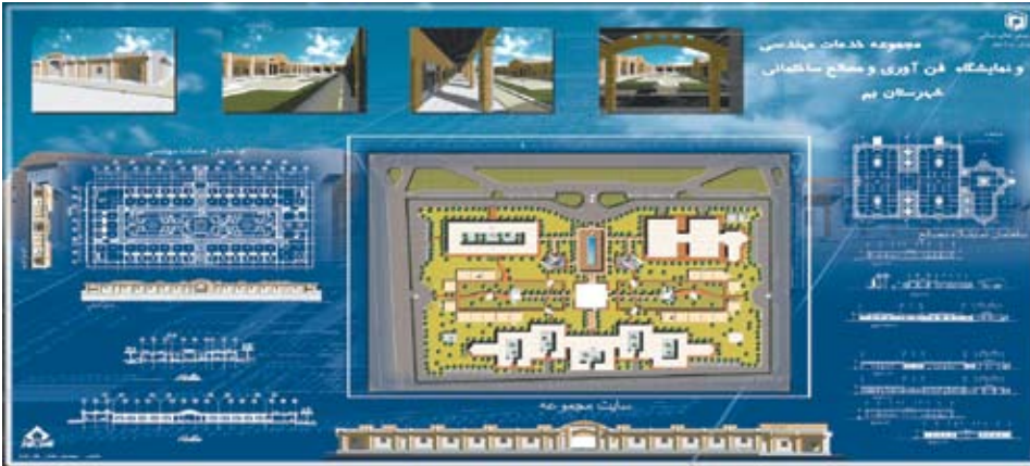
Fig 9: Exhibition site for construction materials and architects offices in Bam.