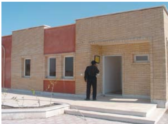
Fig 8: Exhibition of proposed new houses.