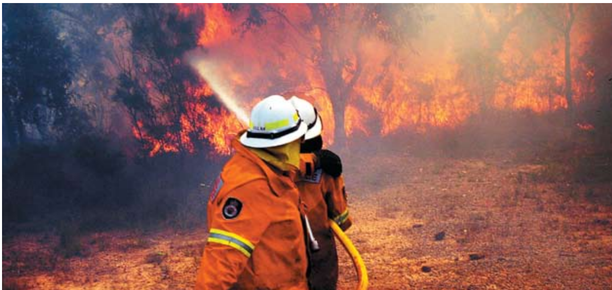
Fire fighters are endangered without vehicular escape routes when fighting fires or backburning.