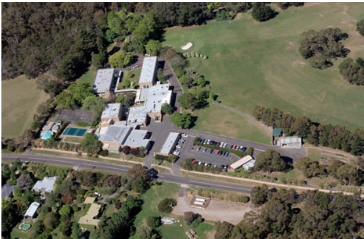
Aerial photo of the Australian Emergency Management Institute at Mount Macedon, Victoria.