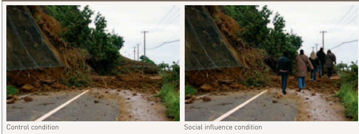
FIGURE 1. Images of landslide with and without social influence.