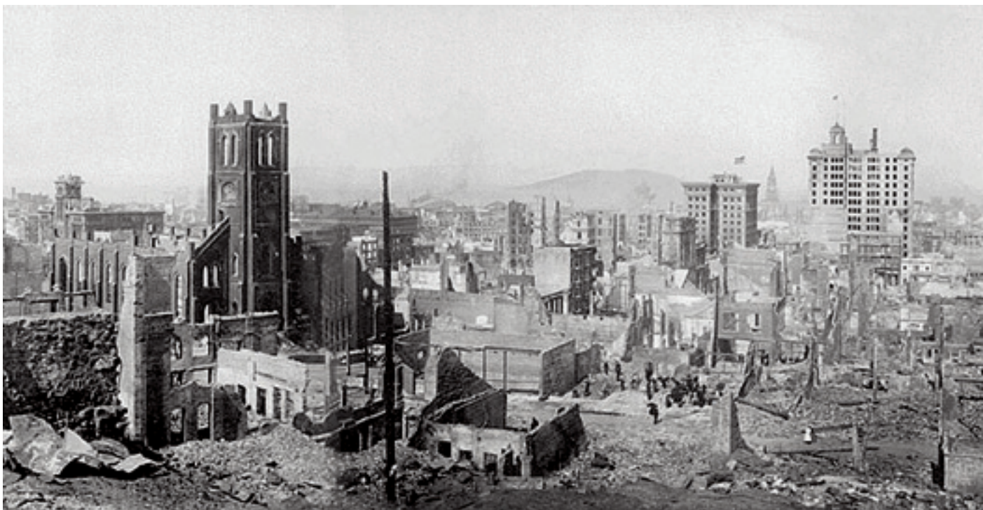
San Francisco earthquake.