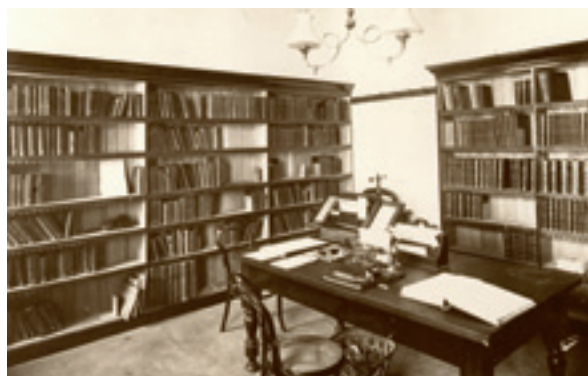
Government Chemical Laboratory Library, research area (circa 1920).

Information Research Services currently has 7.5 full time staff which includes the Library Manager, 4 x liaison/liaison support (including collection management and document delivery) and 2.5 staff in electronic and technical services.