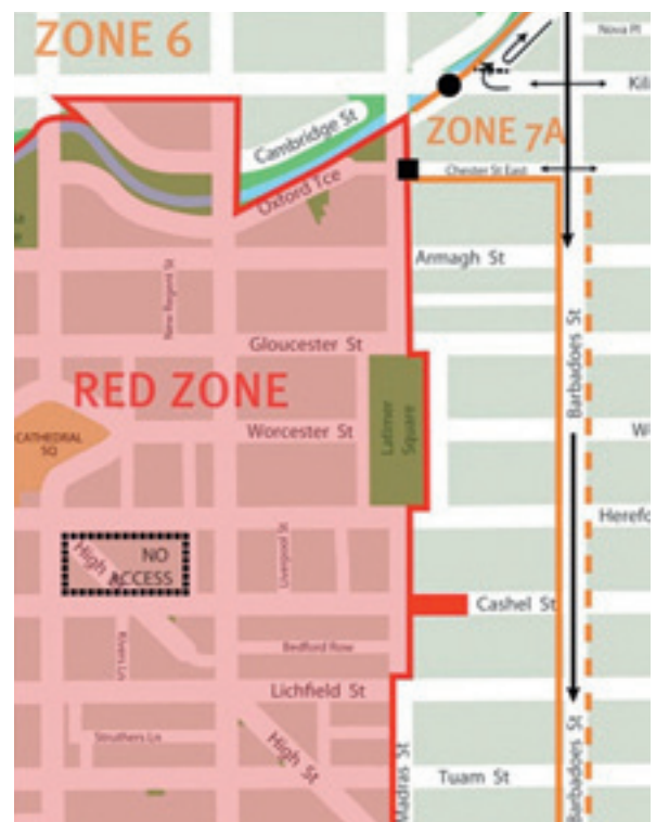
Virtually the whole of the Central Business District was cordoned off as the no-go 'Red Zone' because of collapsed or compromised buildings. The rest of the inner city was divided into zones and opened progressively.

Mayors, councillors and Members of Parliament play an important but ill-defined role during emergency responses. While focus is on managing the emergency, Mayors can be briefed for media appearances and public meetings to reassure the community. Christchurch Mayor Bob Parker was acknowledged as the face and voice of the earthquake response in September 2010, and in February 2011 he filled the same role. From 25 February, he and the National Controller spoke at every press conference.