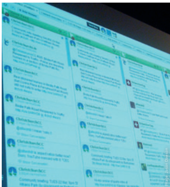
The Public Information Section monitored social media, and projected tweets on the wall so team members could see what was trending.