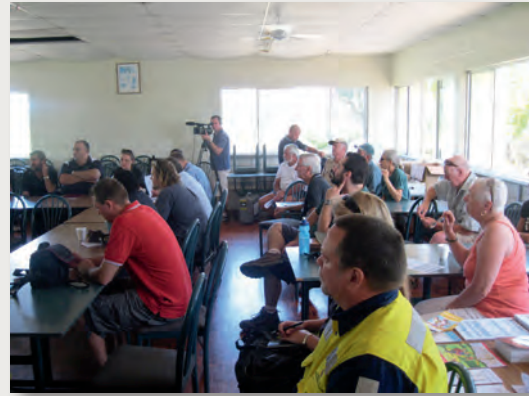
Pre-exercise briefing to participants