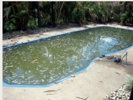
Raw sewage in swimming pool