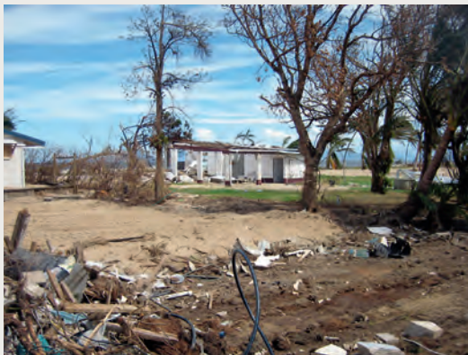
Tidal surge destroyed some houses