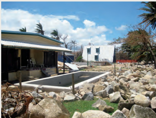
Damaged beachfront rock wall