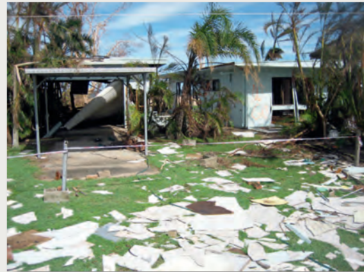
Asbestos containing material littered private, public and state land