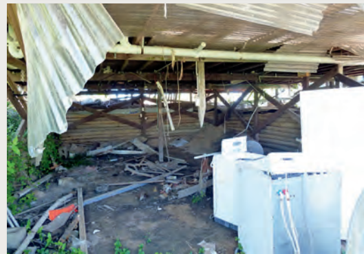
Field tests allowed participants to test the tools and make assessments