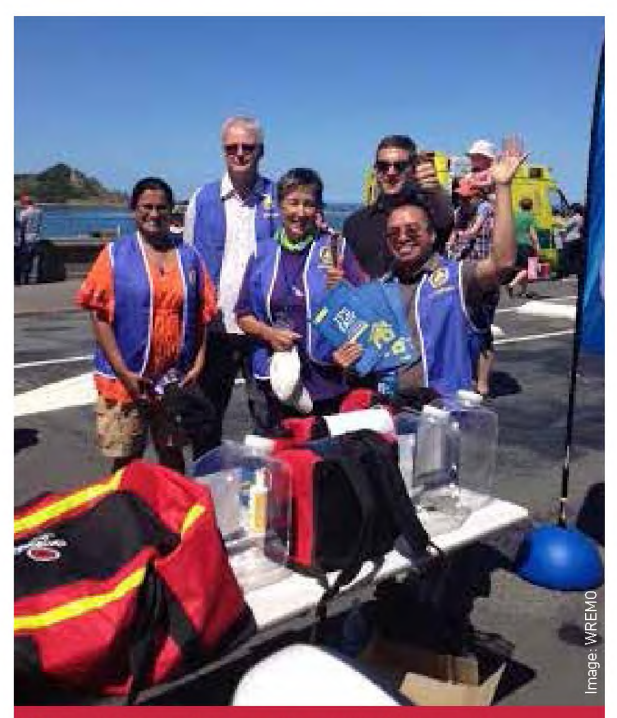
Community members are encouraged to promote preparedness in their local areas.

effective and efficient from the outset. We have experienced a huge surge of interest since revamping this program because the approach supports a way for anyone to get involved and contribute.