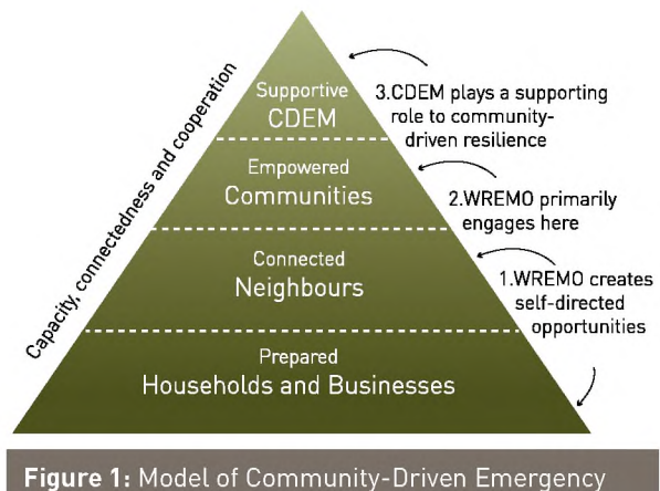
Figure 1: Model of Community-Driven Emergency Management.

To help guide our resilience compass north, the team developed a Community Resilience Strategy that provides a set of engagement principles, such as 'listen first' and 'focus on local solutions', as well as a range of tools for individuals and organisations to get involved in ways that are appropriate for them, not us. Instead of educating everyone to achieve 'Rambo Level 5' preparedness, the approach has focussed on developing a wide range of tools that cater to diverse interests and levels of commitment. For the less enthusiastic, minimal engagement might be through a painted blue tsunami marker line on the road or nothing more than following WREMOnz on Facebook. For those who have greater interest or time, completing a CDEM volunteer training program or participating in the creation of community response plans helps build capacity and foster co-operation. A Continuum of Engagement model presented in Figure 1 provides an example of how these tools are represented by a person's level of interest.