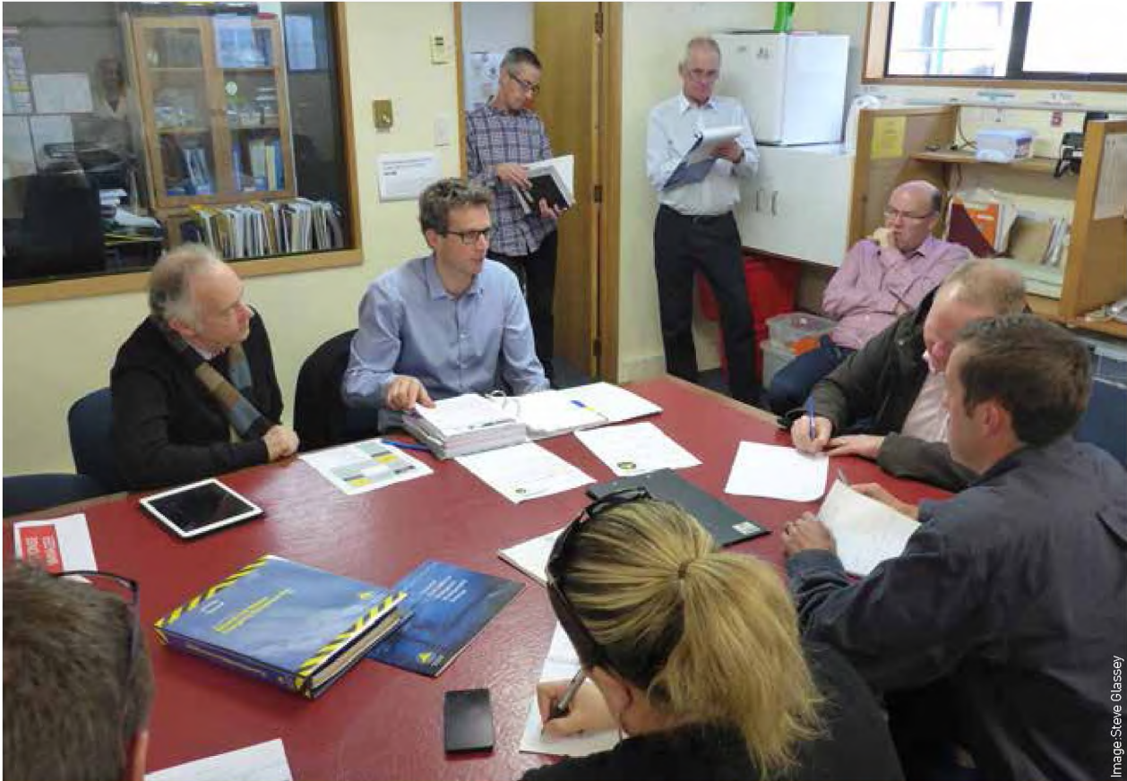
An incident management team tests Standard Operation Procedures during Exercise Phoenix, June 2015 in Waitaki, New Zealand.

groups and the lack of any requirement for emergency managers to have higher education qualifications compounds this division. Using a panel of practitioners and academics, After Action Reports along with other sources of information (such as research projects, inquiries, evaluations) are codified into an online knowledge repository (such as a wiki), which is regularly reviewed. This approach encourages practitioners and academics to work closely together.