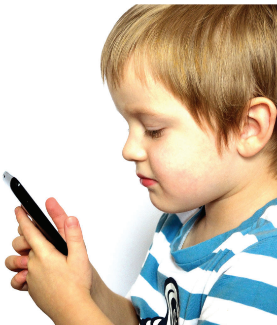
Calling Triple Zero (000) from mobile phones does not require the phone to be unlocked.

When calling Triple Zero, the caller also needs to inform the Triple Zero operator of the precise location of the emergency, including the state, town and street address. It is also helpful if the caller can provide the phone number they are calling from. The pilot version of the Teacher's Guide included a 'My Phone Number and Address' card for children to take home and complete with their parents or guardians as a homework activity. However, the interviews revealed that this approach had been largely ineffective. While 13 of the 22 children interviewed knew what town they lived in, only five knew their full street address. Furthermore, only one child knew which state they lived in and only one child could recite their phone number. These findings indicated that relegating this learning to a homework activity represented a significant gap in the Teacher's Guide. This lesson has been revised to include class-based activities to help children learn their state, town, street address and phone number.