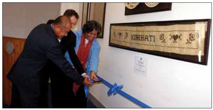
PACIFIC PARTNERSHIPS: Kiribati Room opening at the ACT Legislative Assembly

Back issues are available at www.aph.gov.au/athmag or email news@aph.gov.au or phone freecall 1800 139 299.