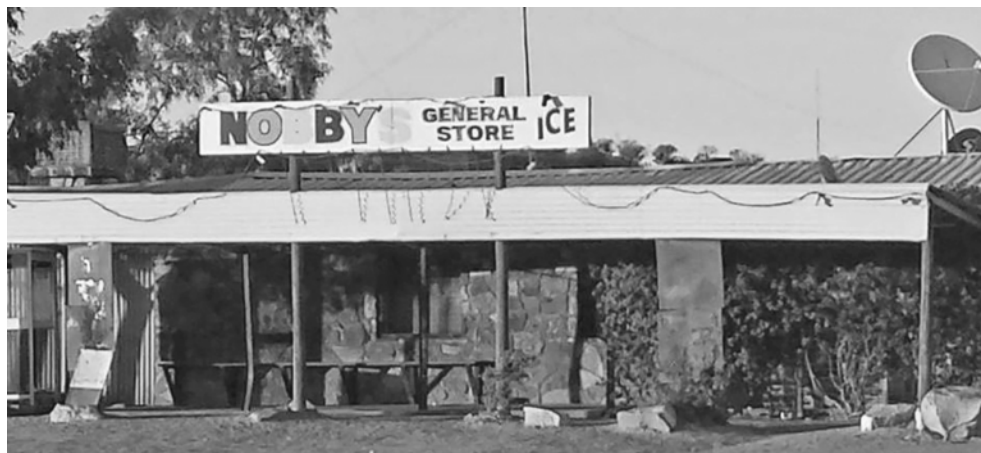
Figure 1: Nobbys 12

Yankunytjatjara Lands ('APY Lands'). 9 They had limited formal education, lacked 'financial literacy', lived far from Nobbys and were generally 'impoverished'. 10 Most could not 'add up' sums of money. 11