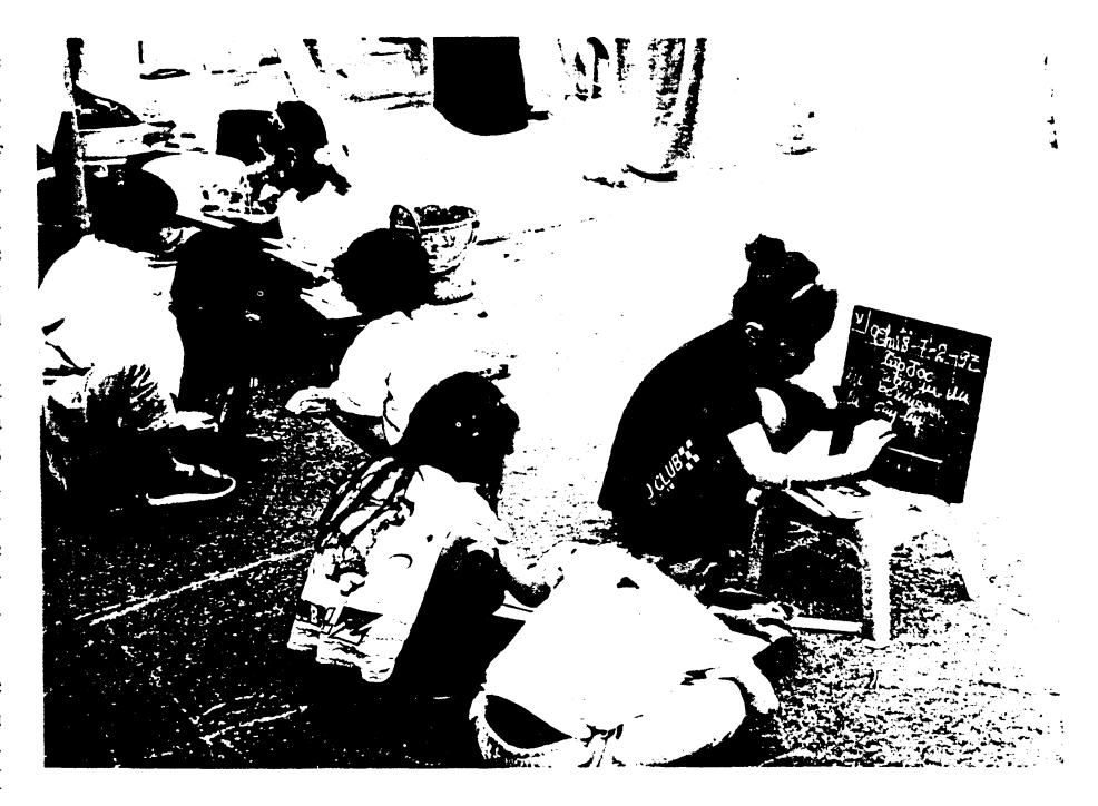
Education in the camps has been axed, leaving the children to fend for themselves. [Whitehead Deternation Centre, Hong Kong, Section 1.]

The US Senate public hearing in July 1995 saw many refugee law experts and lawyers working closely with refugees testifying that the determination procedure is riddled with problems of translation, obtaining information, guidance for the applicants on procedures and their right to appeal. Most importantly, in Hong Kong the process is overridden by an executive desire to halt refugee arrivals to such an extent that international law for refugees is being wilfully ignored. In addition, the screening process has been severely compromised by the extent of corruption among immigration officials, most notably, in the Philippines and Indonesia.