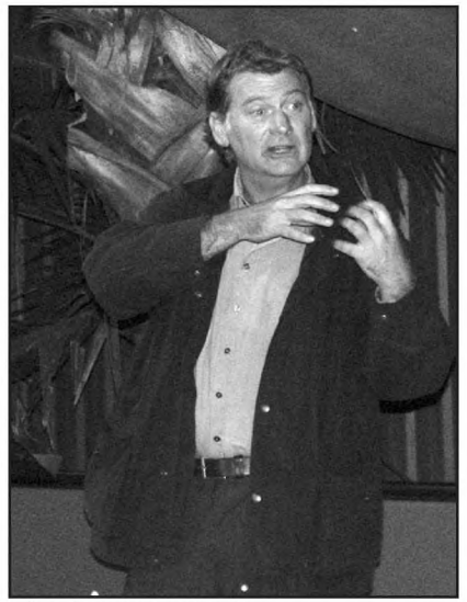
The debate begins!