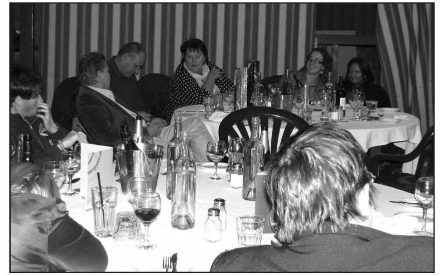
Relaxing towards the end of the evening