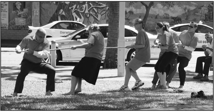
Cridlands MB tighten their grip