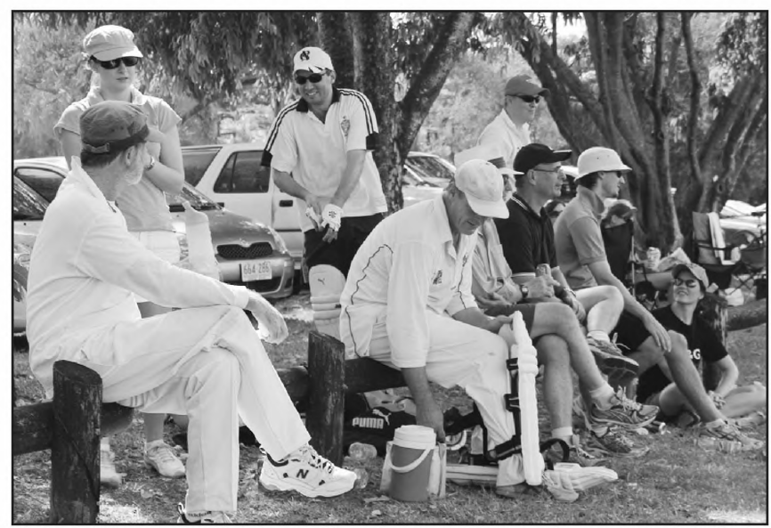
The Chief Justice's XI discuss tactics!