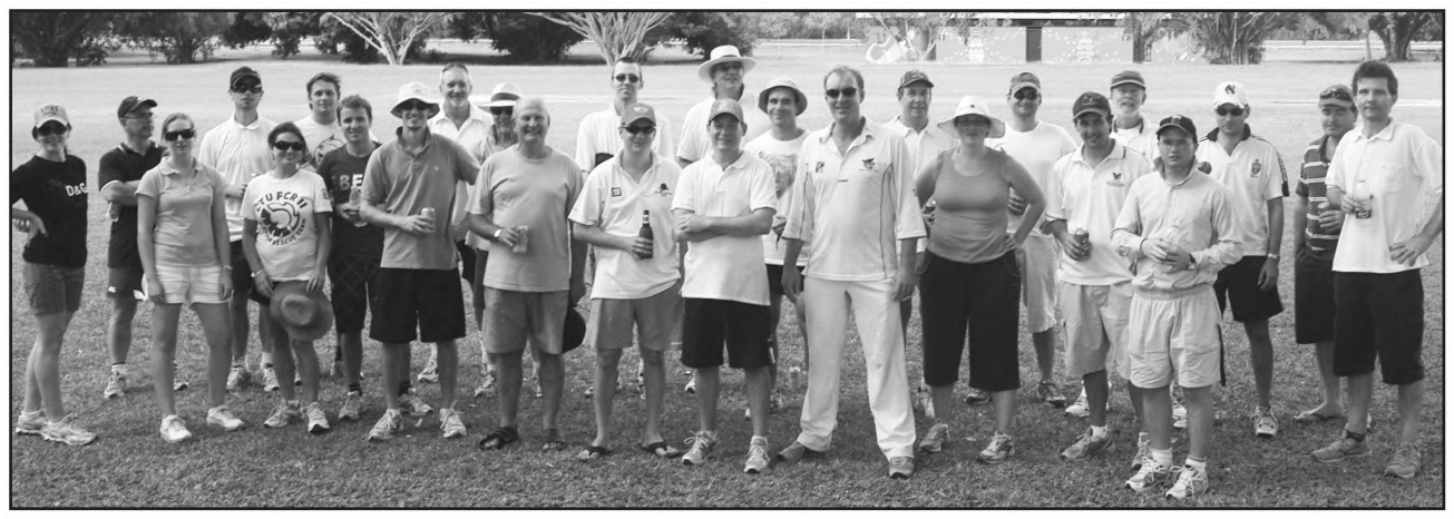
A well earned drink following the match