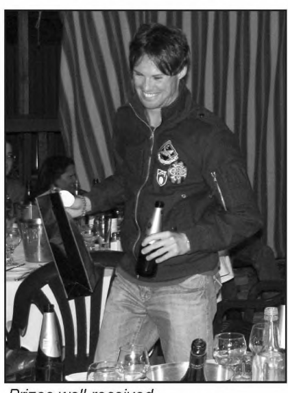
Prizes well received