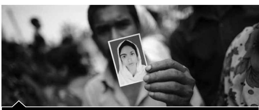
A relative holds a picture of a missing garment worker, who was in the Rana Plaza building when it collapsed in Bangladesh in 2013.

For the first time in 2014, the Castan Centre has published a report featuring fresh perspectives on many of its vital research areas.