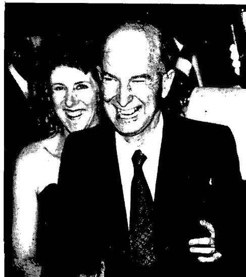
The only leprechaun Judge in the English speaking world.