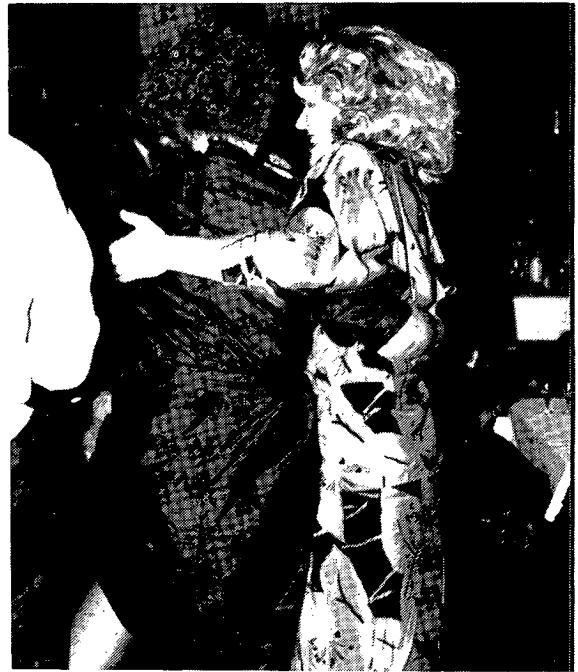
Decorum began to slip around midnight . . .