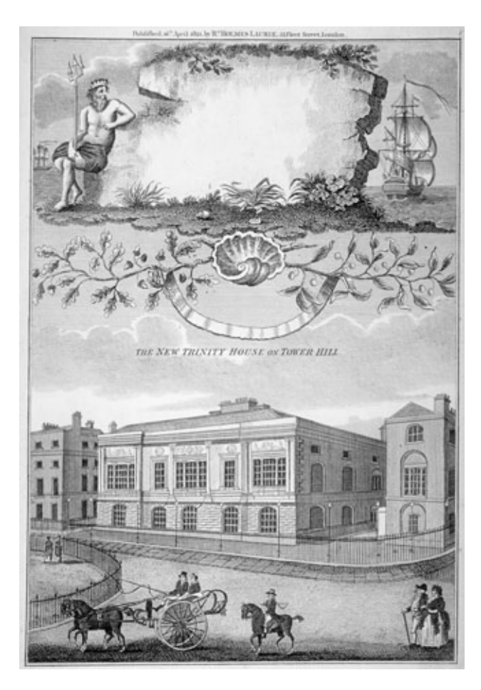
Trinity House, Trinity Square, City of London, 1821.

You have not all gathered here this weekend in Adelaide to hear me speak on maritime law and procedure. However the tool of the assessor, if carefully and thoughtfully used, could be of great utility to the modern judge hearing a case about any expert