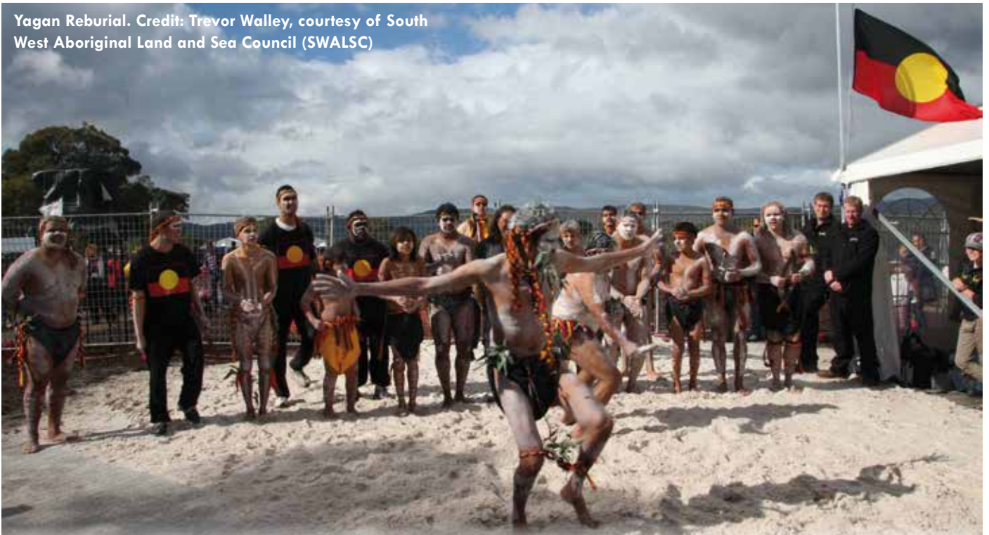
Yagan Reburial.