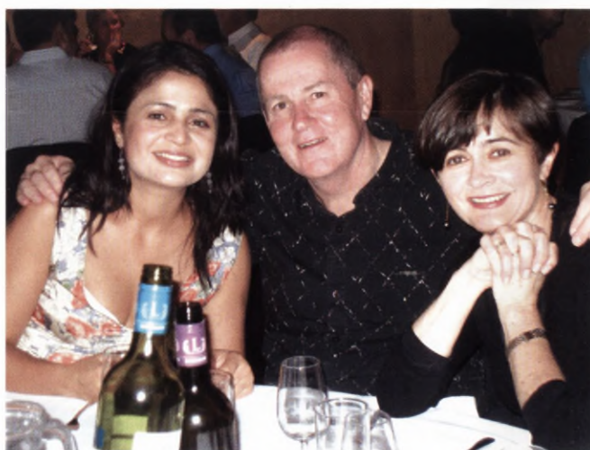
Delegates enjoying the conference dinner at Lindemans Winery