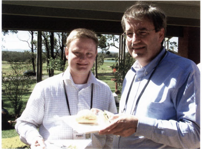
Delegates enjoying lunch at Hunter Valley Gardens

Social highlights included the conference dinner at Lindemans Winery, as well as a winery tour on Saturday afternoon accompanied, needless to say, by some fine wine! ■