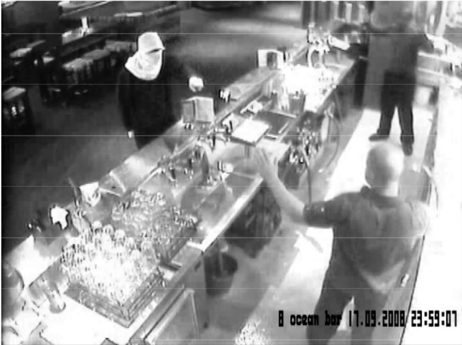
Figure 1. CCTV image of ‘Dolichocephalic man’ carrying a hammer.