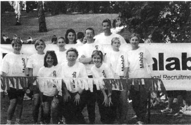
Mahlab Recruitment, the event's sponsors, fielded a large team.