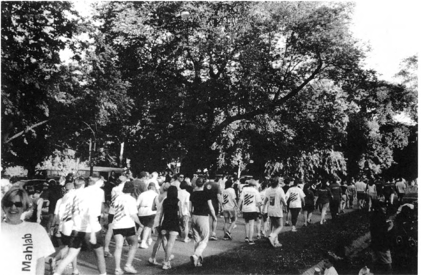
Over 350 runners and walkers participated in the most successful Young Lawyers Fun Run ever.