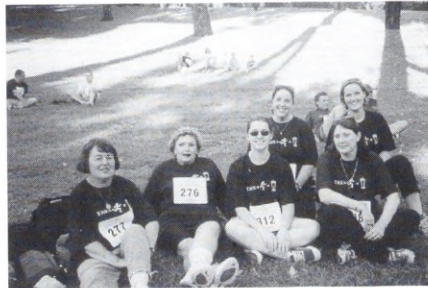
Waiting for the race to start...

Following the race, the Law Institute hosted a gourmet barbecue for all participants overlooking the banks of the Yarra River.