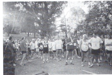
Runners await the start of the race...