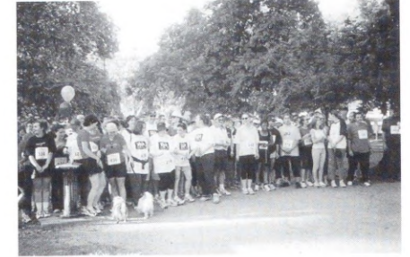
The starting line