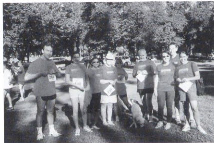
The team from Brian Ward & Partners