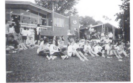
Competitors enjoying a gourmet BBQ after the race