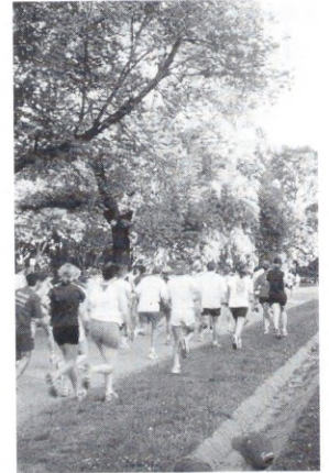
The race begins...