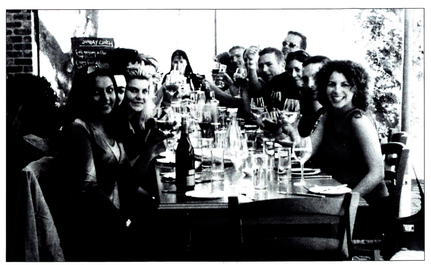
LUNCH ALFRESCO AT CLEVELAND WINERY

On behalf of the Social Committee we welcome everyone to our events for 2002 and we hope that we are able to cater to all your wishes.