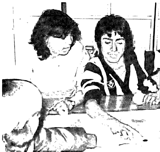
Students at the Collingwood Education Centre in Melbourne play the Immigration Game.

Game (a bilingual kit in English and Spanish) are more relevant to many children in Australia than Monopoly! Like all Hodja materials, the games were designed by teachers and educationists working with members of ethnic communities.