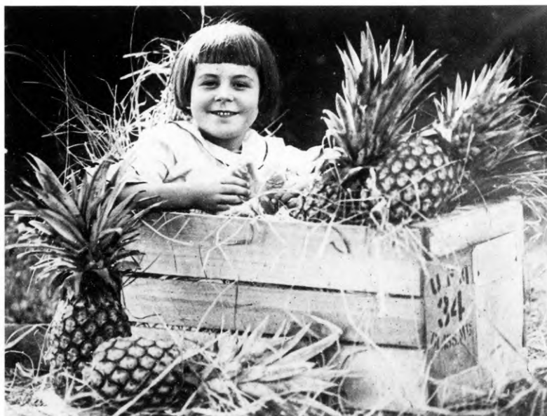
Pineapple girl: a photograph promoting Queensland fruit, displayed at the Empire Exhibition, United Kingdom 1924.

For more information about National Library events, services and collections become a subscriber to the monthly e-newsletter at http://www.nla.gov.au/nla/listerv/subscribe.html . ■