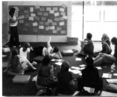
Brainstorming at The Edge

To deliver our aims and aspirations we approached Fieldworx, a community engagement consultancy firm, to manage this complex and exciting program. Initial engagement has been achieved by The Edgy Advisors, a core group of young people that inform, critique and celebrate the key stages of the redevelopment. The approach is supported by multi-arts processes including fieldtrips, internet research, photography and film based